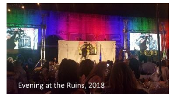
Evening at the Ruins, 2018